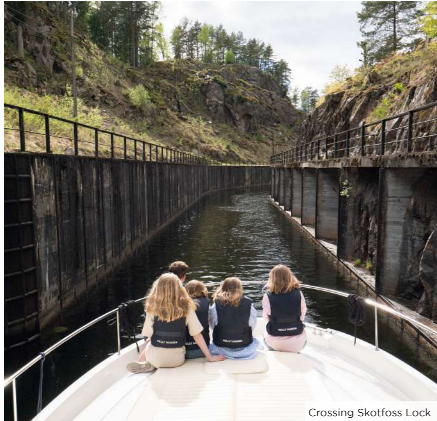
Crossing Skotfoss Lock